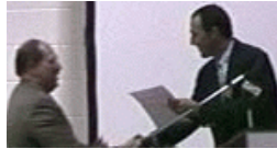
Joint IDA presents award.

The 2001 Beautification Award was presented to Crisp Manufacturing in recognition of landscaping and other efforts to enhance the external appearance of the company's facility in Rural Retreat. Wytheville Technologies, Inc., was welcomed and recognized as the newest member of our industrial community. A special award was presented to Bland County for its crucial role in the formation and initial Participation Project of the Crossroads Regional Industrial Facility Authority. Wytheville Technologies, Inc., was the first revenue sharing project among local jurisdictions under the Virginia Industrial Facilities Act. Wythe County and Wytheville were also recognized for their participation in the Crossroads Industrial Facility Authority.