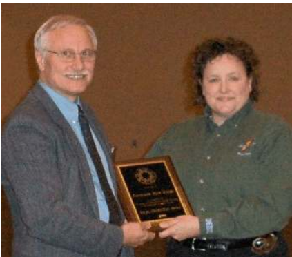
Gatorade Blue Ridge receives the Joint IDA's Special Recognition Award for 2008.

Industry tenure awards will be presented at a luncheon event in January 2009.